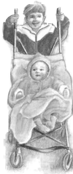
Recommended Childhood Vaccination Schedule

For more information about immunising your child, phone your local Public Health Unit or talk to your family doctor.